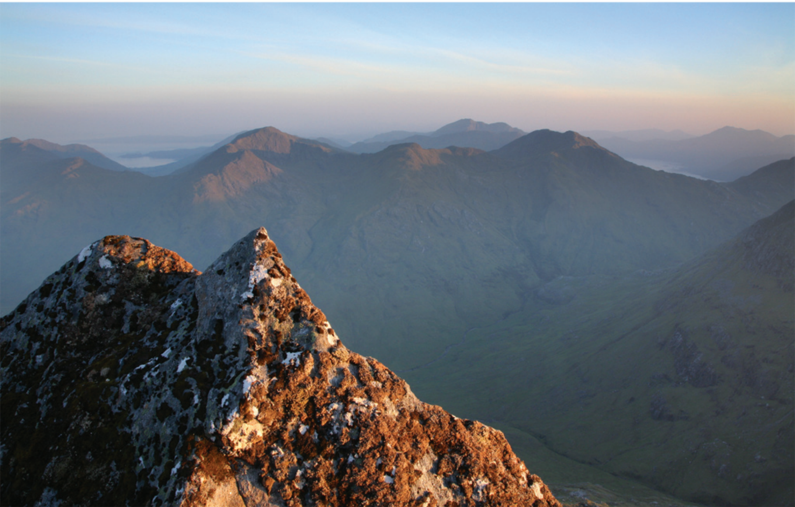
Sgurr Sgeithe and Ladhar Bheinn beyond, seen from Sgurr Na Ciche, Knoydart peninsula