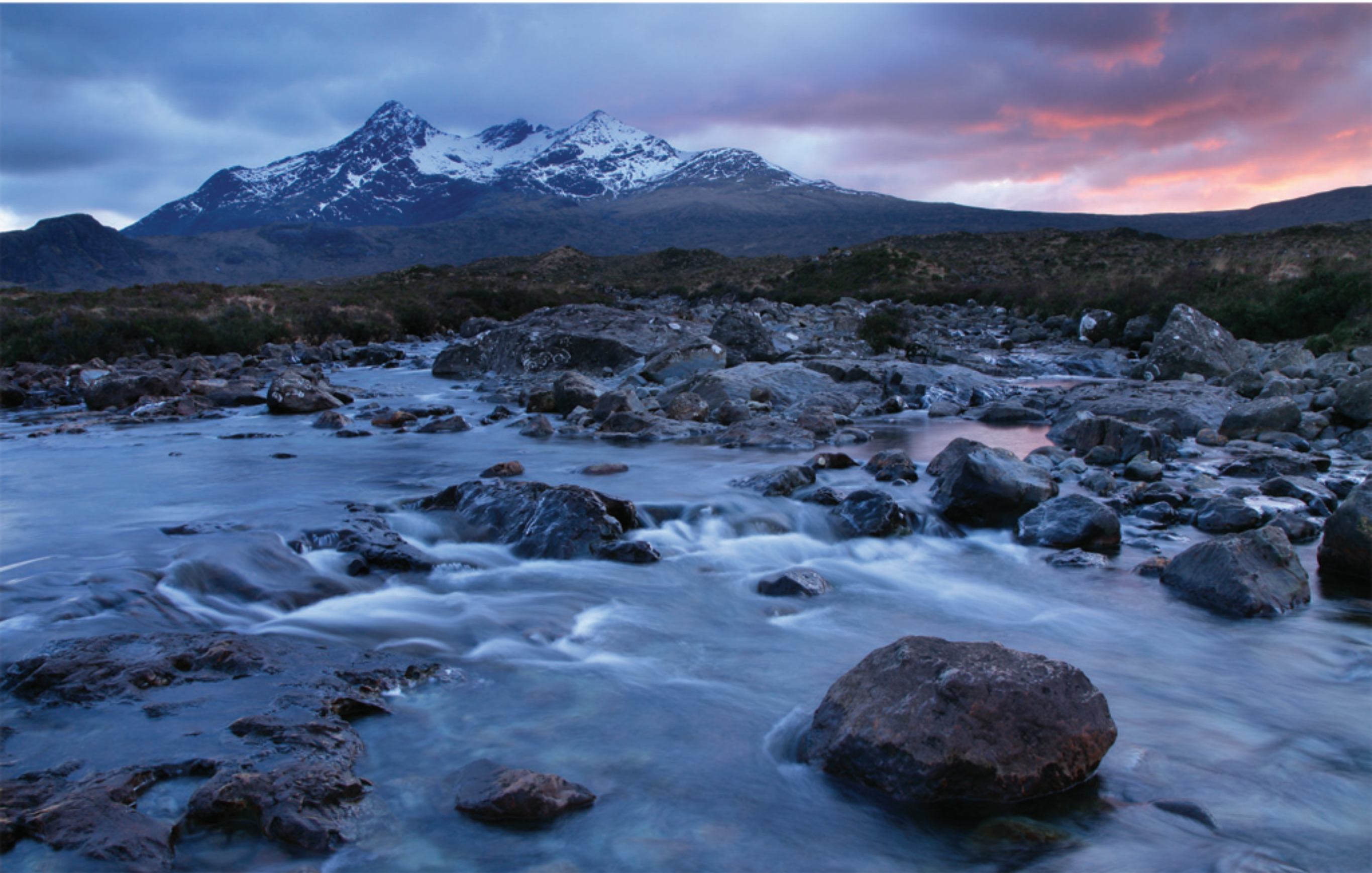
The Black Cuillin and the Sligochan River, Isle of Skye